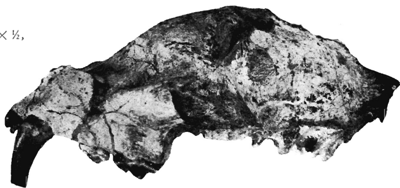
Left side view, \times \frac{1}{2} ,