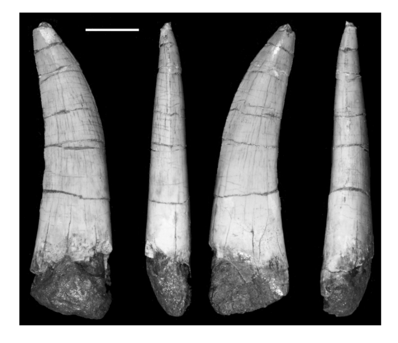
Fig. 1 Tooth XMDFEC V0010 seen in (left to right) labial, anterior, lingual and posterior views Scale bar = 10 mm

The tooth is long, tapers evenly to the tip and is very slightly D-shaped in cross-section being somewhat more flat on the lingual face and bowed on the labial face (though this is overall much closer to a circular cross-section than a more normal laterally compressed theropod tooth as is common for spinosaurids). The tooth exhibits a gentle posterior recurvature along its length. In anterior and posterior view, it shows a slight sinusoidal curve labio-lingually (see Fig. 1), a feature that does not appear to be the result of breakage or distortion.